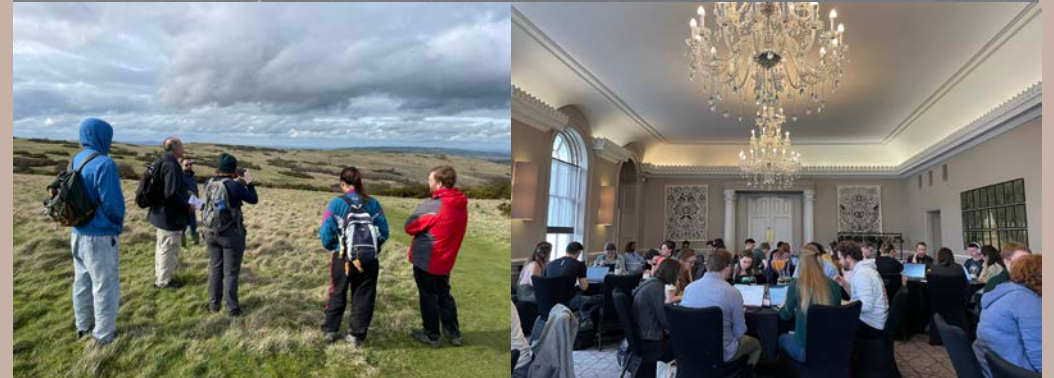
TRiPP 2024, Cheltenham & The Cotswolds